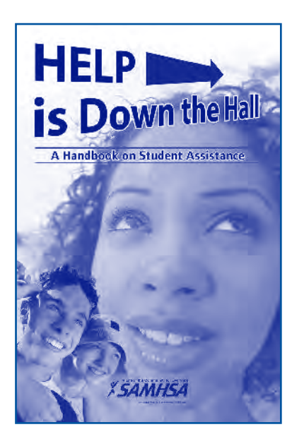
Free Download: nacoa.org/student-assistance-programs